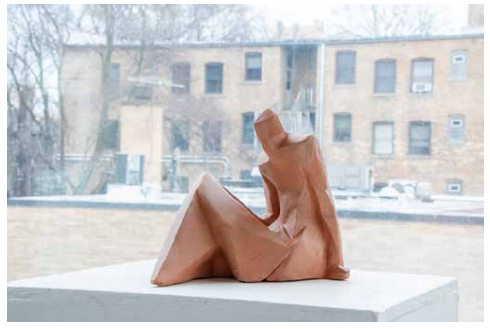
Sueko Kawamura.

sic drawing skills that never fail you. Discover how to look closely to draw quickly and effectively. Bolster your confidence to sketch comfortably in public, within the short time frame of a lunch break or a sightseeing tour. Skill Level: Beginner EAC Member $195 / Non-Member $215