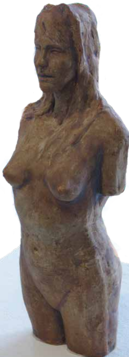
FIGURE SCULPTURE CLASSES ON PAGE 16

Skill Level: Intermediate EAC Member $330 / Non-member $350