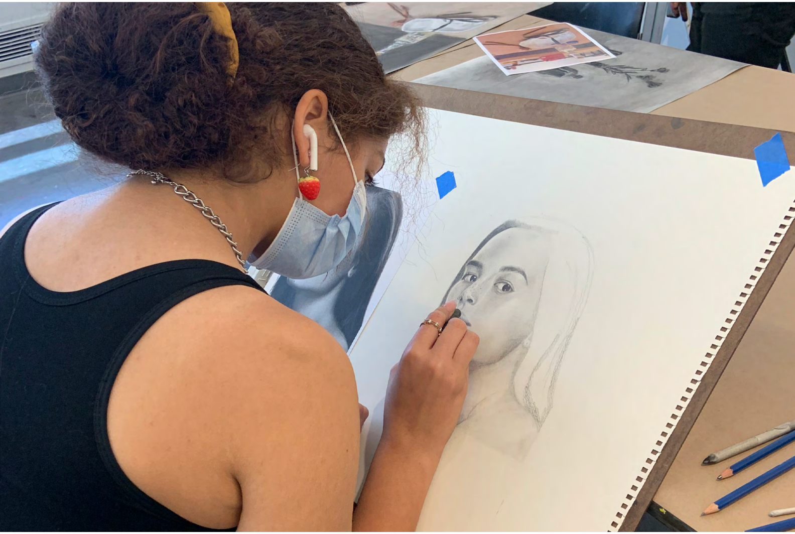
Teen painting and drawing