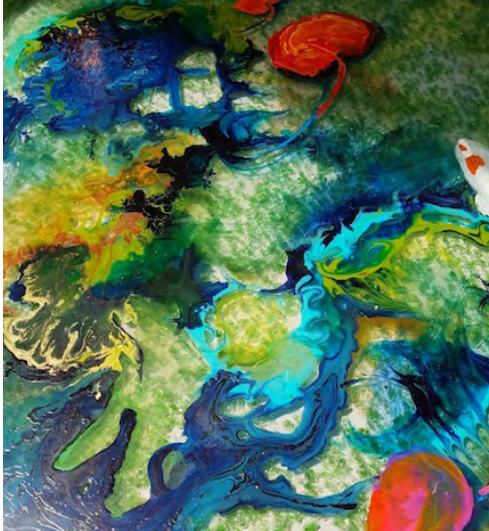
Sandra Bacon in Expressive Acrylics