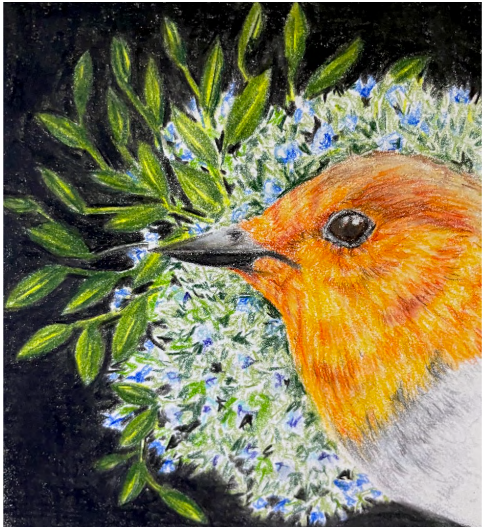
Colored Pencil Flora and Fauna - Lyndsay Murphree