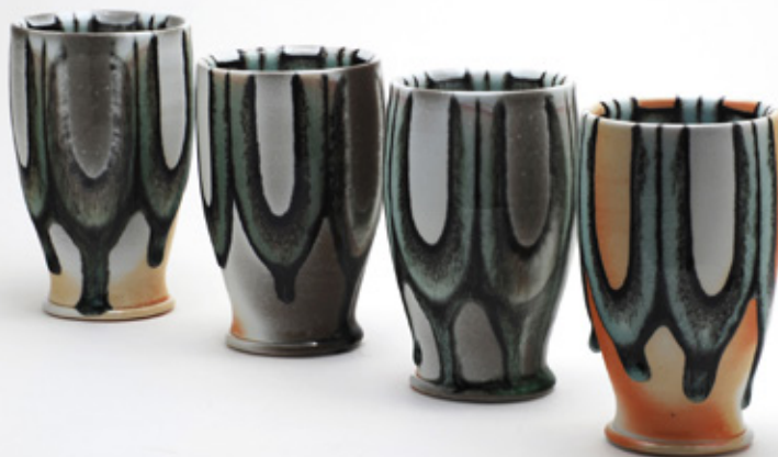
Pint Glasses and Image by Nolan Baumgartner