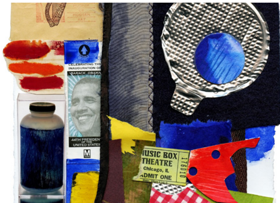
Collage Container - "Obama" by Deirdre Colgan