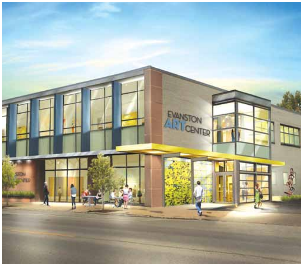
ARCHITECT'S DRAWING, THE DOBBINS GROUP