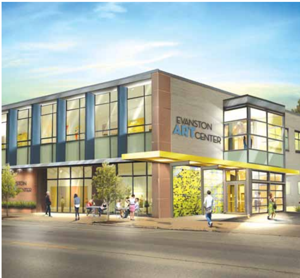
ARCHITECT'S DRAWING, THE DOBBINS GROUP