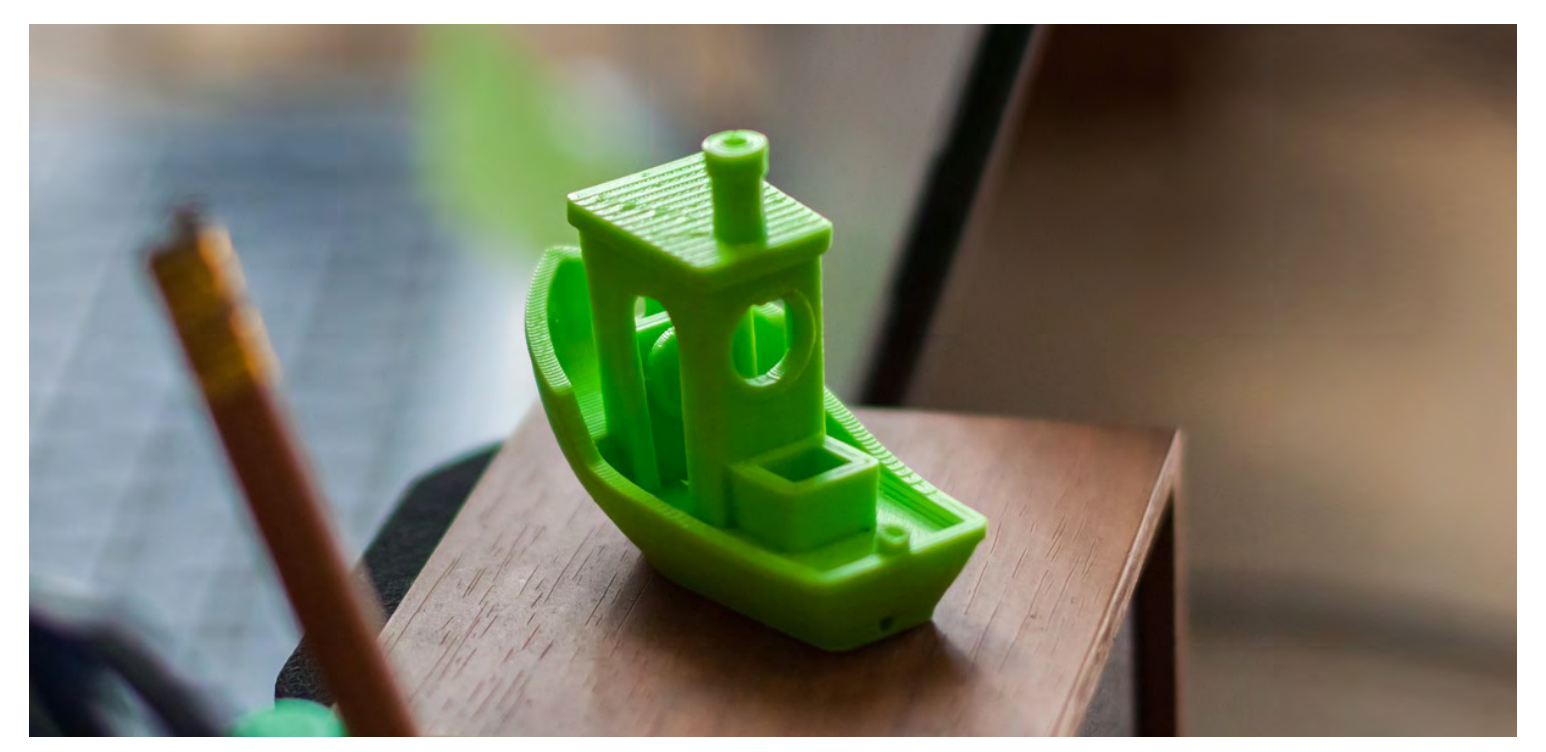
Rui Sha, 3D Modeling and Printing