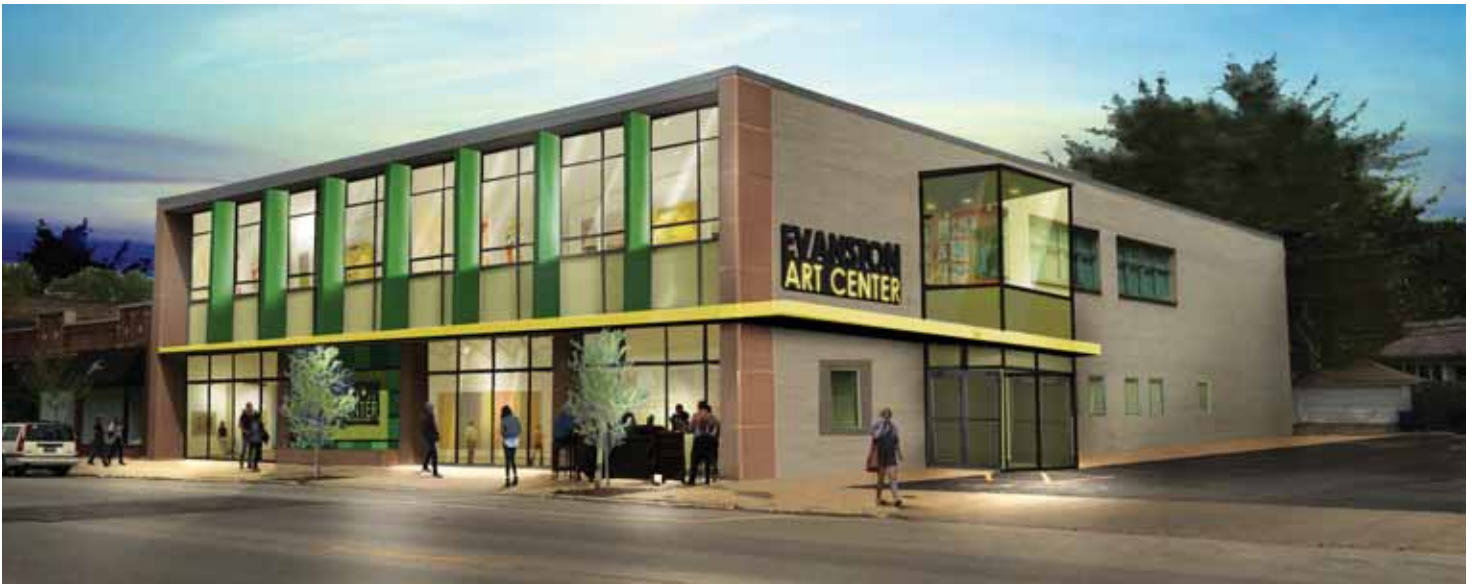
Architect's drawing, The Dobbins Group