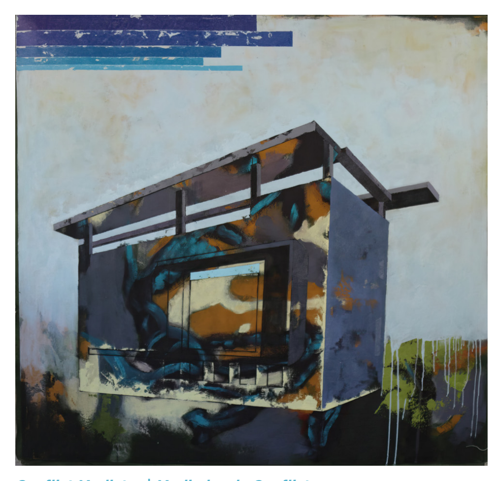
Conflict Mediator | Mediador de Conflictos 2015. Acrylic on canvas, 121 cm X 128 cm

Here, we encounter a pessimistic view, represented in an organic form, symbolized through the inkblots attempting to escape or trapped inside a rigid geometric structure that floats in the air. We see the trampoline-like feature at the top of the structure, suggesting a leap into the void, into space signifying an escape. In this dramatic context of forms and feelings, the intention in the title Conflict Mediator seeks to achieve some balance, a way to mediate the conflict between organic form and geometry, just as in life given the countless dualities.