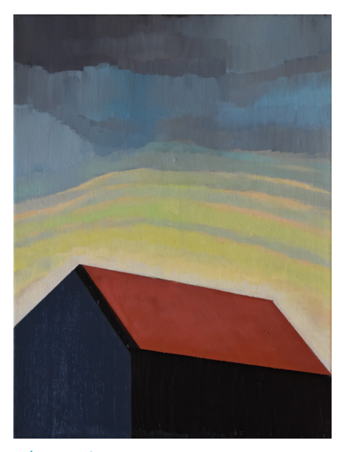
Atmosphere | Atmosfera 2016. Oil on jute, 30.5cm X 40.5 cm

The reference used here again relies on the small beach house neighborhood, quite close to Hershey, adopting a more existential approach. We find here the idea of an uncommunicative family, represented by the houses sitting side-by-side, but not isolated. In this series, we notice that the artist often uses objects to represent people and human feelings. The houses are people, and the object again becomes animated, communicating a message through a painting loaded with symbolism.