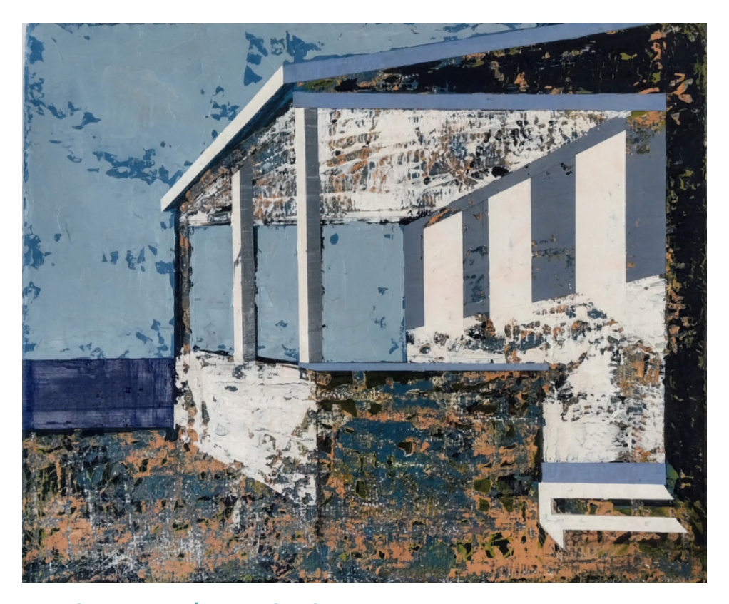
Beach House III | Casa de Playa 2017. Oil on jute, 50 cm X 60 cm

"Subjectively, this work reminds me of the interior of the sugar processing plant, its workshops, some spaces of which persist in my memory." Viewing this work suggests an abandoned space and open windows, housing a tool related to the sugar mill possibly in disuse, a piece of equipment that, when placed in the center of the canvas, is humanized, becoming the dramatic protagonist of this abandoned space. Next to the sugar scattered across the floor, a machine in perpetual solitude, condemned to uselessness, suggests above all a certain nostalgia that dominates Hershey today. The artist resolves the composition using a few artistic resources, through geometric synthesis and using spots of color, all of which guide us on his journey from figures to abstraction loaded with symbolism.