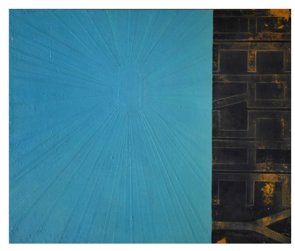
Hershey 2019. Acrylic on canvas, 49 cm X 60.5 cm

In this painting, the model town's nameplate "Hershey" features prominently, alongside the subjective composition with imaginary lines that evoke a train journey heading towards blue infinity. The artist emphasizes reality: although the Cuban Revolution attempting to change the town's name, giving it the name of a revolutionary commander, Camilo Cienfuegos, positioning it in the sugar mill towers, removing any hint of its past as a model city established by the North American, Milton Hershey. Today, the town is known and recognized, both within and beyond its limits, by its original name, the sign for which remains in the local train station.