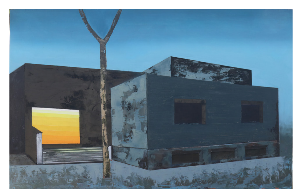
On & Off 2016. Oil on canvas, 62 cm X 99 cm

Here, we encounter a pessimistic view, represented in an organic form, symbolized through the inkblots attempting to escape or trapped inside a rigid geometric structure that floats in the air. We see the trampoline-like feature at the top of the structure, suggesting a leap into the void, into space signifying an escape. In this dramatic context of forms and feelings, the intention in the title Conflict Mediator seeks to achieve some balance, a way to mediate the conflict between organic form and geometry, just as in life given the countless dualities.