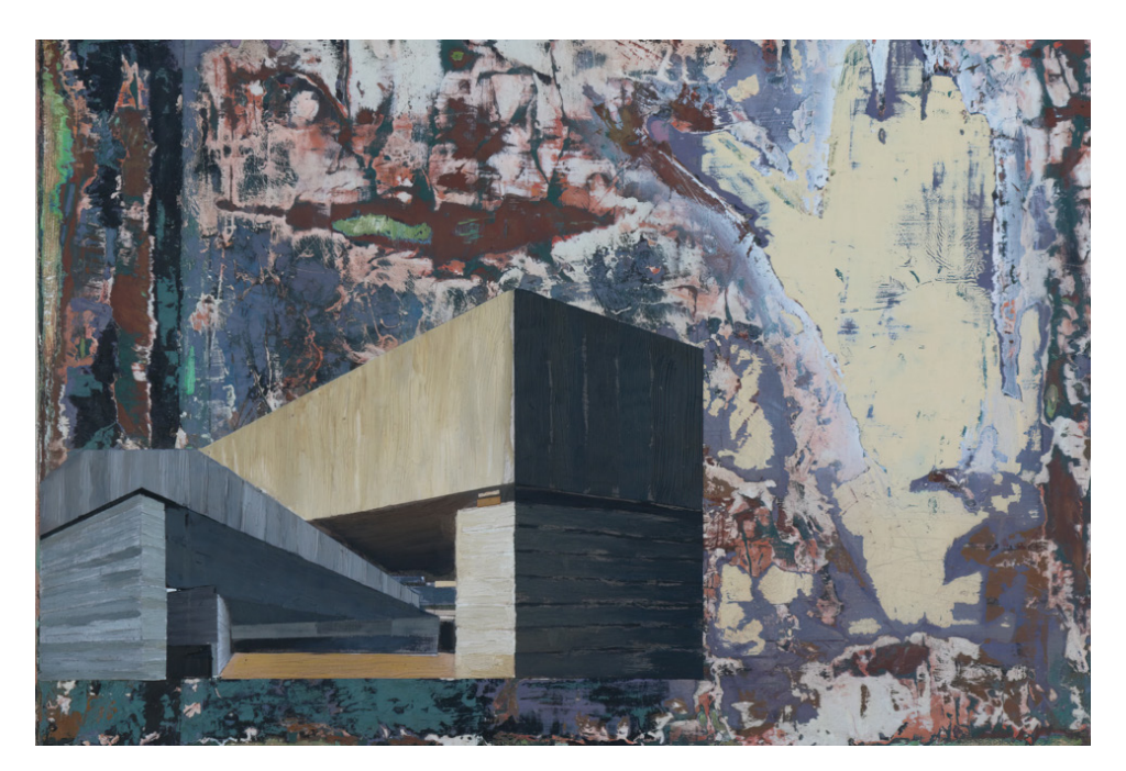
Hand That Builds, Hand That Destroys | Mano que construye, mano que destruye 2017. Oil on canvas and collage, 30 cm X 40 cm

It was a place of incredible importance to Cuba's economy until the 1970s and for the community formed there, adhering to a specific pattern of industrialization of the late nineteenth and early twentieth centuries, characterized by the so-called model city, an industrial village configured to house its employees and equipped with the facilities necessary for their well-being. Today, the mill is a mere shell, inactive and dilapidating. "I had this vision when I climbed the hill from the beach house, the first thing I saw was the three towers, and the second was one of the warehouse façades in the sugar mill complex. This shape still exists. I attempted to combine the form with the texture of the place and create this symbiotic relationship."