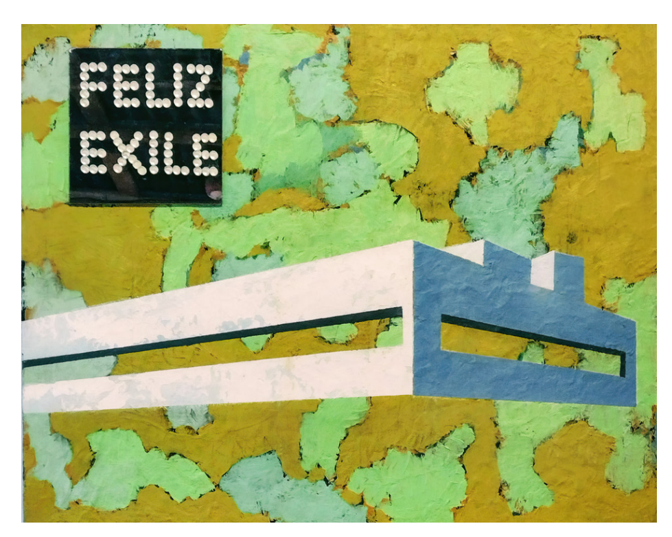
Happy Exile | Feliz exile 2016. Oil on canvas and mirror plate, 50 cm X 63 cm

Here, we find a key feature composed of mirrors and silicon dots constructing the phrase, Happy Exile . This message reflects characteristics rooted in the artist's symbolism and his life: the idea of an exile that begins internally as a boy from an island, who quite early confronts a horizon, which generates a mix of curiosity and anguish. This idea consolidates when he moved from Hershey to Havana, and from Havana to a new country, Brazil, after deciding to immigrate, aware that the values proclaimed by the Cuban Revolution were not his own, and the way of life imposed on the Island, as well as the insurmountable horizon, left him feeling deeply imprisoned. "Using mirrors fascinates me, since those who view them share the same feelings since becoming an exile represents a challenging process."