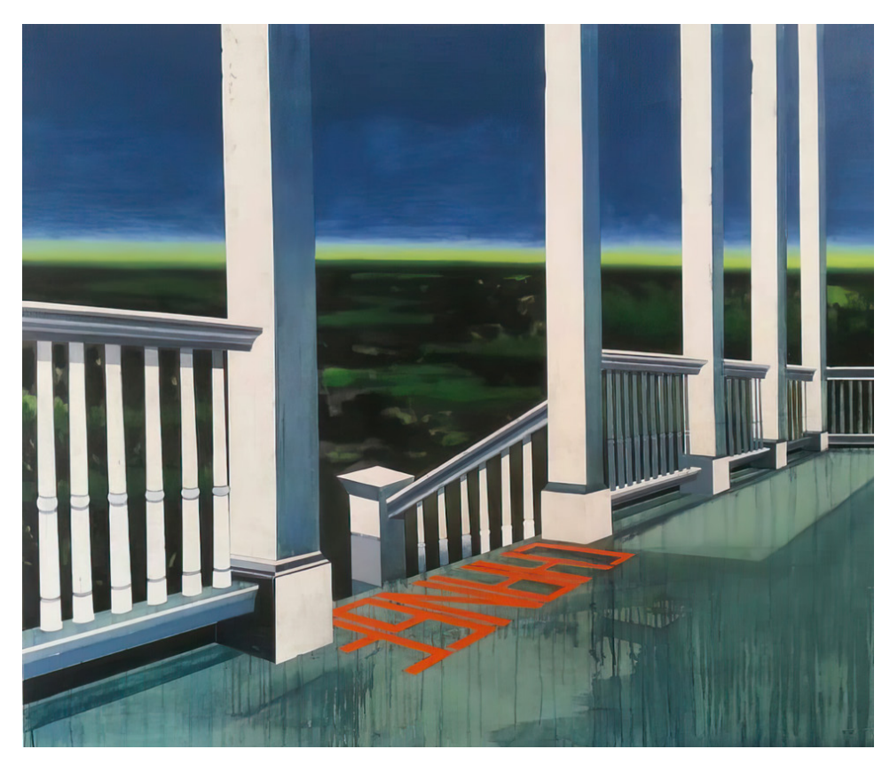
Change | Cambio 2019. Acrylic and oil on canvas, 153 cm X 184 cm

This work recalls a children's playground, the gates of the Hershey houses in Cuba, constructed in keeping with the American style, featuring large portals and stairs that lead to the main entrance and where "WELCOME" signs are usually placed. In this case, the standard sign is replaced with the slogan "CHANGE," stating the need for change: "Things need change. You can't allow an idea to stagnate. For many years, Cuba has needed change." The landscape of a near reaction, an almost reactionary blue and green, against a hazy horizon, symbolizes a chemical reaction in the air, rendering the landscape as inhospitable in the artist's memories.