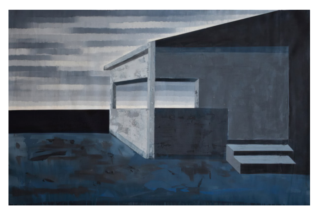
Beach House I | Casa de playa I 2019. Oil on canvas, 100 cm X 130.5 cm