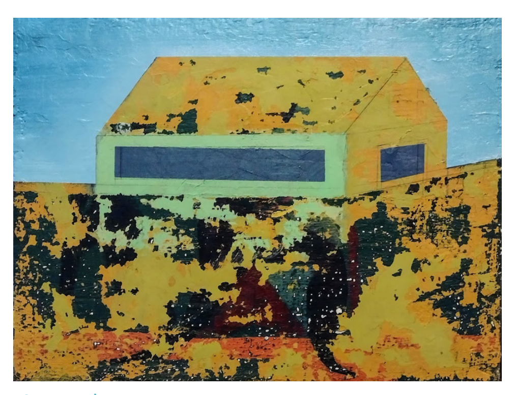
Shoe Tree | Horma 2016. Oil on jute, 30.5cm X 40.5 cm

This piece offers more surrealism, imagining a house as a mailbox. Simultaneously, this space can symbolize play, for games, resembling a foosball table, given its suspension in air. As a mailbox, the house is equally unserviceable; it neither holds nor receives letters, thereby not serving its purpose. Freely interpreted, we glimpse the possibility of and desire for the house itself, being transported to another place, just as letters and the artist's message travel between two worlds: memory and concrete reality.