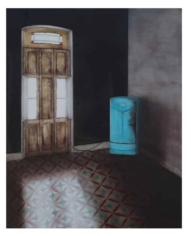
Interior IV 2013. Oil on canvas, 50 cm X 40 cm

In this painting, the model town's nameplate "Hershey" features prominently, alongside the subjective composition with imaginary lines that evoke a train journey heading towards blue infinity. The artist emphasizes reality: although the Cuban Revolution attempting to change the town's name, giving it the name of a revolutionary commander, Camilo Cienfuegos, positioning it in the sugar mill towers, removing any hint of its past as a model city established by the North American, Milton Hershey. Today, the town is known and recognized, both within and beyond its limits, by its original name, the sign for which remains in the local train station.