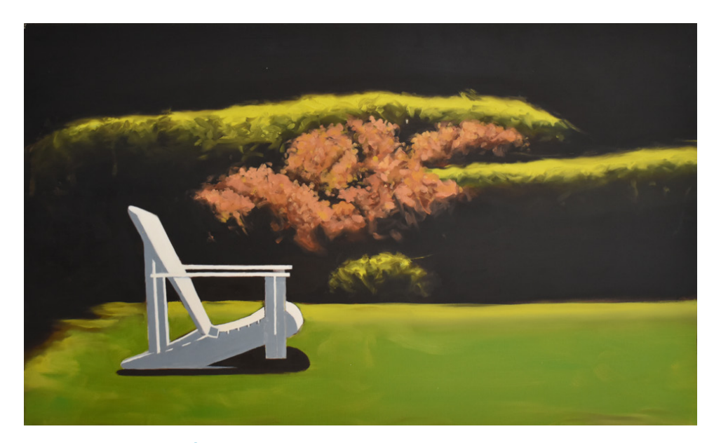
Vanishing Point | Punto de fuga 2013. Oil on canvas, 70 cm X 120 cm

This work recalls a children's playground, the gates of the Hershey houses in Cuba, constructed in keeping with the American style, featuring large portals and stairs that lead to the main entrance and where "WELCOME" signs are usually placed. In this case, the standard sign is replaced with the slogan "CHANGE," stating the need for change: "Things need change. You can't allow an idea to stagnate. For many years, Cuba has needed change." The landscape of a near reaction, an almost reactionary blue and green, against a hazy horizon, symbolizes a chemical reaction in the air, rendering the landscape as inhospitable in the artist's memories.