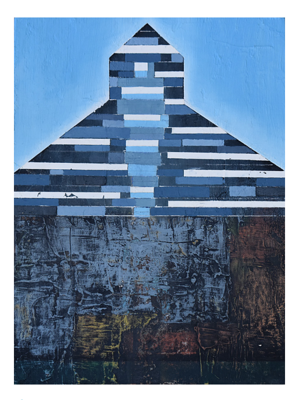
The Sugar Mill | El Central 2019. Oil on canvas, 40 cm X 30 cm

The Sugar Mill captures the Hershey sugar factory, a significant landmark in the city, a three-tower factory featuring various warehouses and spaces for processing sugar. The artist visited the factor with his grandfather, the site administrator, to record harvests.