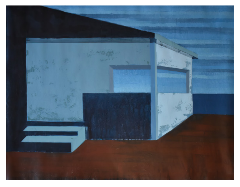
Beach House II | Casa de playa II 2021. Acrylic on canvas, 100 cm X 160 cm

The diptychs: Beach House I and Beach House II, as a set show through the subjectivity of memory the house that remained in the artist's memories, a simple summer house he helped his father build on virgin beaches along the coast near the town of Hershey. It took a while to build the beach house given the lack of materials available in Cuba: "I never wanted to create a representation of the house from photos, relying instead on a more subjective memory." There were no photos of the house, and these images reflect not the real house, but how the artist remembers it and treats it with the colors, the sky, and the textures. All reflect his ideas regarding life, in layers that add to each other and in the whole that forms a mirror, a mirrored house, another subjective view from the artist which he uses to reflect himself. In doing so, he confronts the time he lived in Cuba against his new reality in another country.