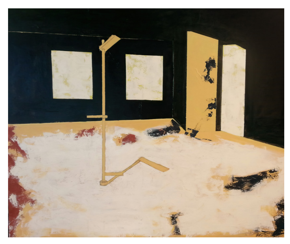
Perpetual Machine | Máquina perpetúaria 2017. Oil and acrylic on canvas, 100 cm X 120 cm

Although most of these pieces feature exteriors, here the artist focuses on an interior, synthesizing the composition to help us to perceive a dramatic work: