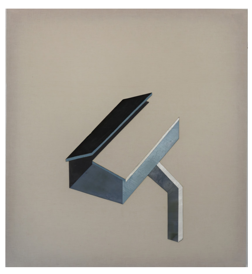
The Mailbox Project | Proyecto del buzón 2016. Collage on canvas, 80 cm X 73.5 cm

In The Mailbox Project , the artist studies the possibility of expanding the scale of his piece The Mailbox , removing the background. This is a re-imagining of his previous work, but with a representation focused more on the geometric form rather than on the landscape or subjective context. He uses the raw canvas, with no preparation, making use of its transparency, upon which he creates a collage composed of layers of oil paint. This represents a collage in dialogue with Brazilian concretism. "Without a doubt, this work refers to my life in São Paulo. After gaining an understanding of the great Brazilian art movements, such as concretism and neoconcretism, this was my first attempt at a dialogue with everything I had learned from this culture, from my own experience."