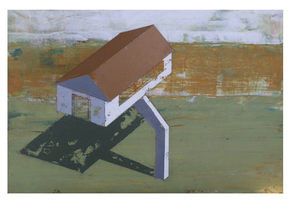
Mailbox | Buzón 2016. Acrylic and oil on canvas, 30 cm X 40 cm

This piece offers more surrealism, imagining a house as a mailbox. Simultaneously, this space can symbolize play, for games, resembling a foosball table, given its suspension in air. As a mailbox, the house is equally unserviceable; it neither holds nor receives letters, thereby not serving its purpose. Freely interpreted, we glimpse the possibility of and desire for the house itself, being transported to another place, just as letters and the artist's message travel between two worlds: memory and concrete reality.